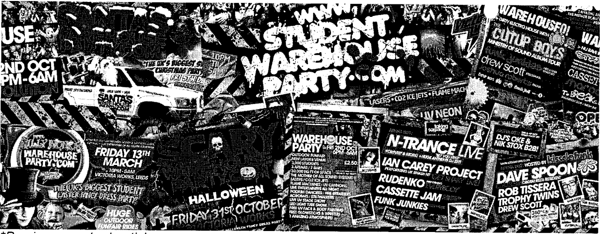
*Previous event advertising