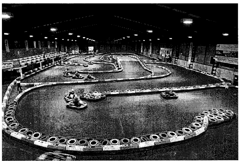
*Pole Position in use as a go cart track