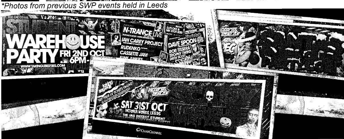
*Previous billboard images used to advertise events to students in Leeds