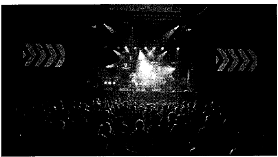
*T-Mobile competition winners party at Pole Position with Lady Sovereign